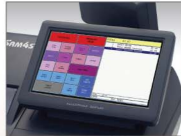
■ The SPS-500 Series has a 7" Touch Screen Operator Display.

Featuring a hybrid design, Sam4s has combined fast and simple ECR keyboard entry with an intuitive touch screen operator display.