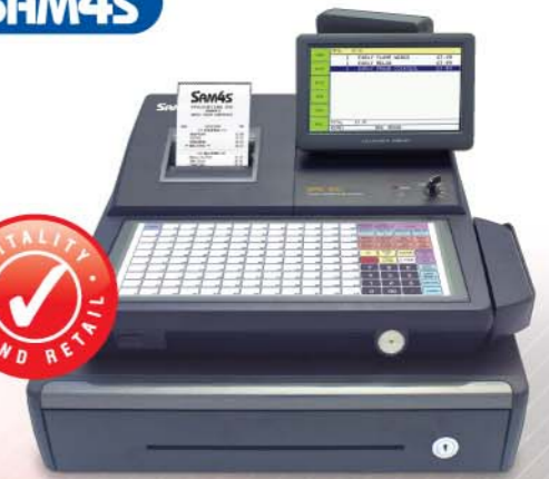
SPS-530 ECR TOUCH SCREEN POS SYSTEM