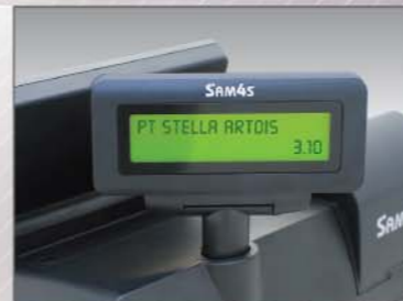
■ The SPS-500 Series has an adjustable Rear Customer Display.