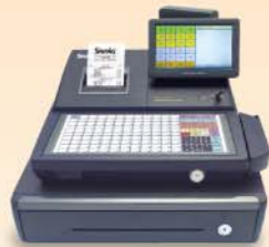
SAM4s ■ SPS-530 Single Station 80mm Thermal Printer (Raised or Flat K/B)