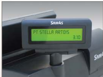
The SPS-500 Series has an adjustable Rear Customer Display.

Featuring a hybrid design, Sam4s has combined fast and simple ECR keyboard entry with an intuitive touch screen operator display.