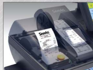
■ The SPS-500 Series has Single & Twin Station Thermal Printers.