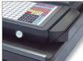
The SPS-500 Series has Magnetic Dallas & (Optional) Mag Card Reader.