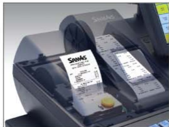
The SPS-500 Series has Magnetic Dallas & (Optional) Mag Card Reader.