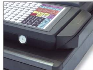
■ The SPS-500 Series has Magnetic Dallas & (Opt.) Mag Card Reader.