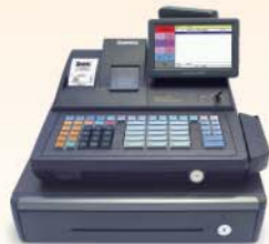
SAM4s ■ SPS-520 Twin Station 58mm Thermal Printer (Raised or Flat K/B)