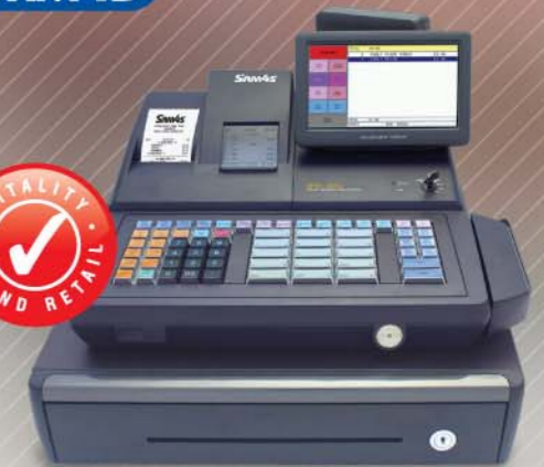
SPS-520 ECR TOUCH SCREEN POS SYSTEM